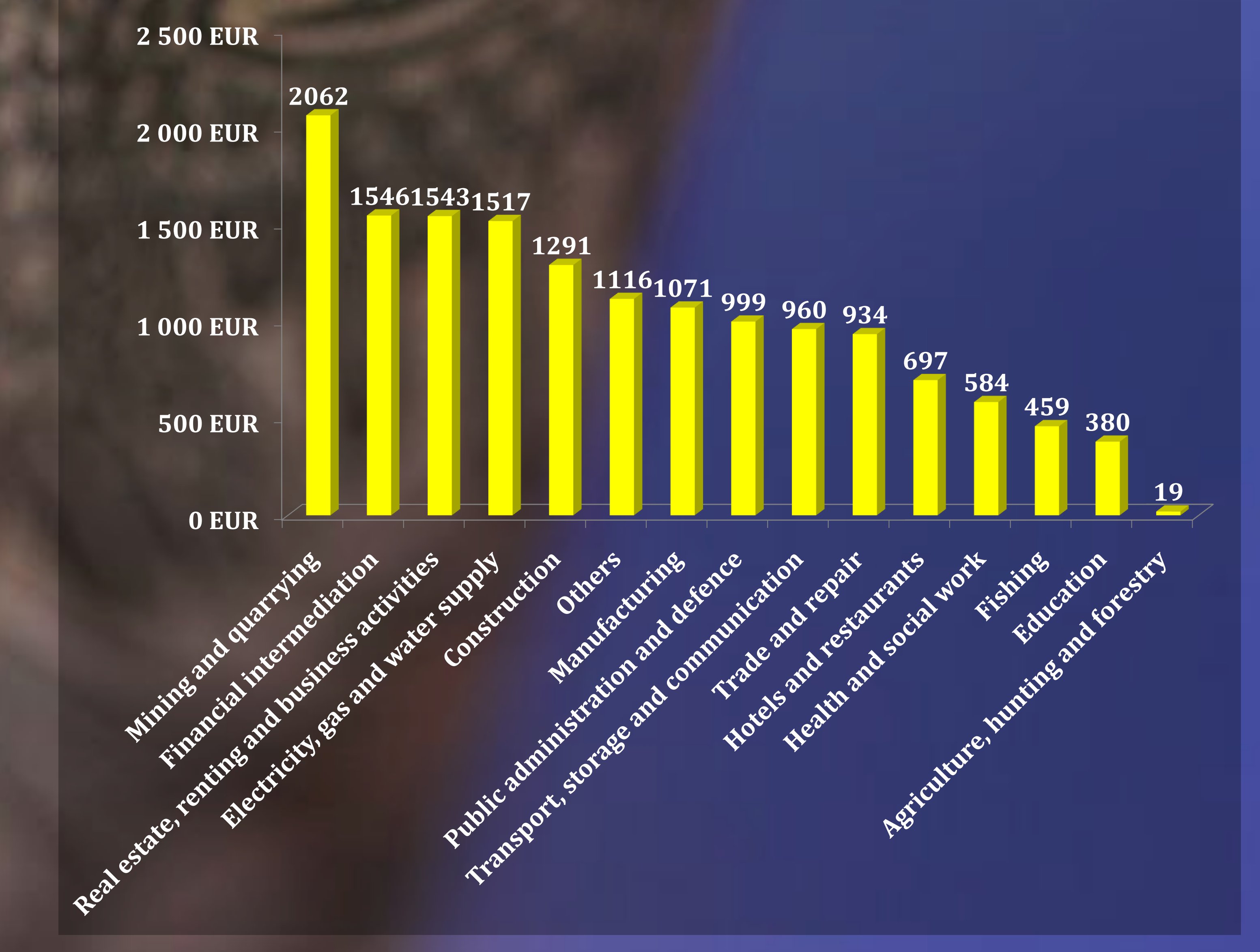
Fig. 2. Sector of economy specific cost of absenteeism per person employed calculated based on gross value.

CONCLUSIONS: Given that ZUS data on amount of mean sick pay seem to provide reliable absenteeism costs in Poland, it would seemed that either data based on wages are underestimated or some compensative mechanisms exist in economy that limit indirect cost of sickness absence.